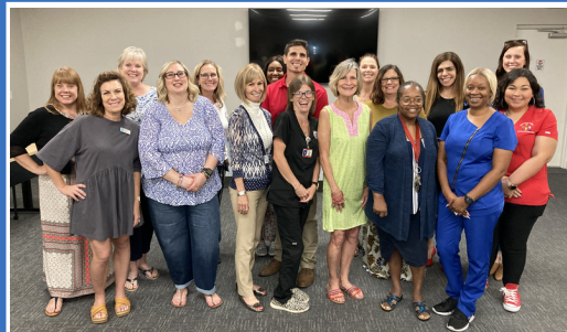
Attendees at ELC Brevard's Provider's Appreciation Luncheon May 11th 2023