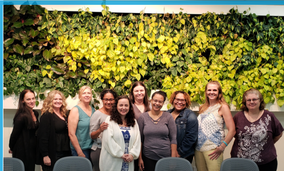
ELC's Family Services Team meeting held at Family Promise of Brevard Featuring the living wall!